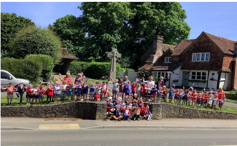
2022 Queen Elizabeth II Platinum Jubilee.