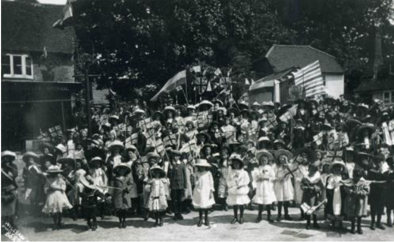
1911 King George V Coronation