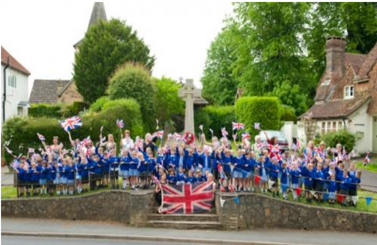
2012 Queen Elizabeth II Diamond Jubilee.